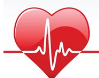
Heart As selected by WGM/WGP

Grand Chapter of Ohio OES Charitable Foundation