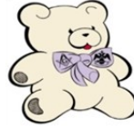
Scottish Rite Children's Learning