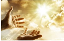
Eastern Star Training Awards Religious Leadership (ESTARL)